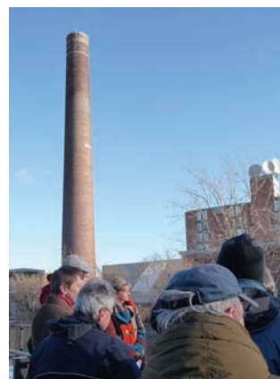
The Montreal Cotton Mills chimney, still standing, right next to the Espace-Madeleine-Parent.