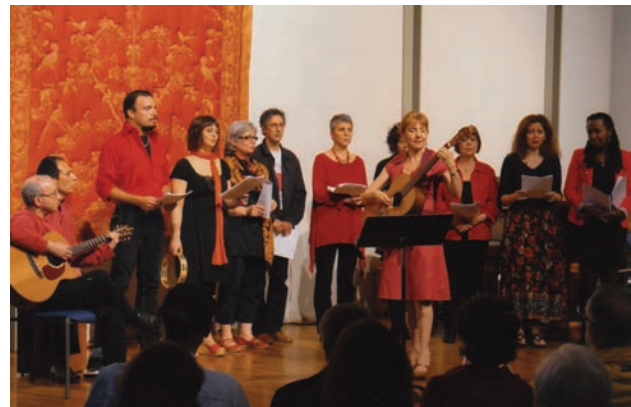
The Life Stories Choir