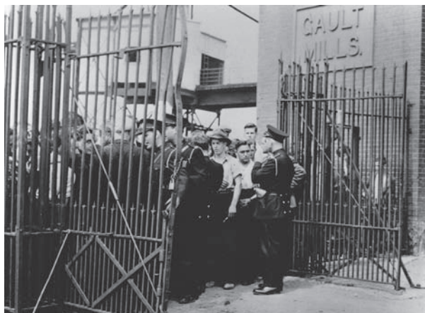
The Valleyfield strike, 1946